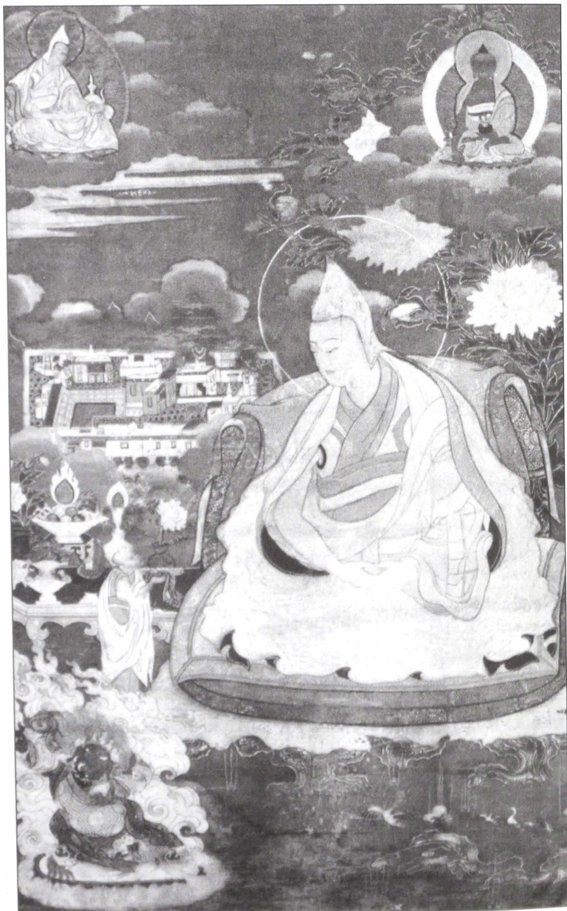
Ngawang Lobzang Gyatso, the Fifth Dalai Lama.