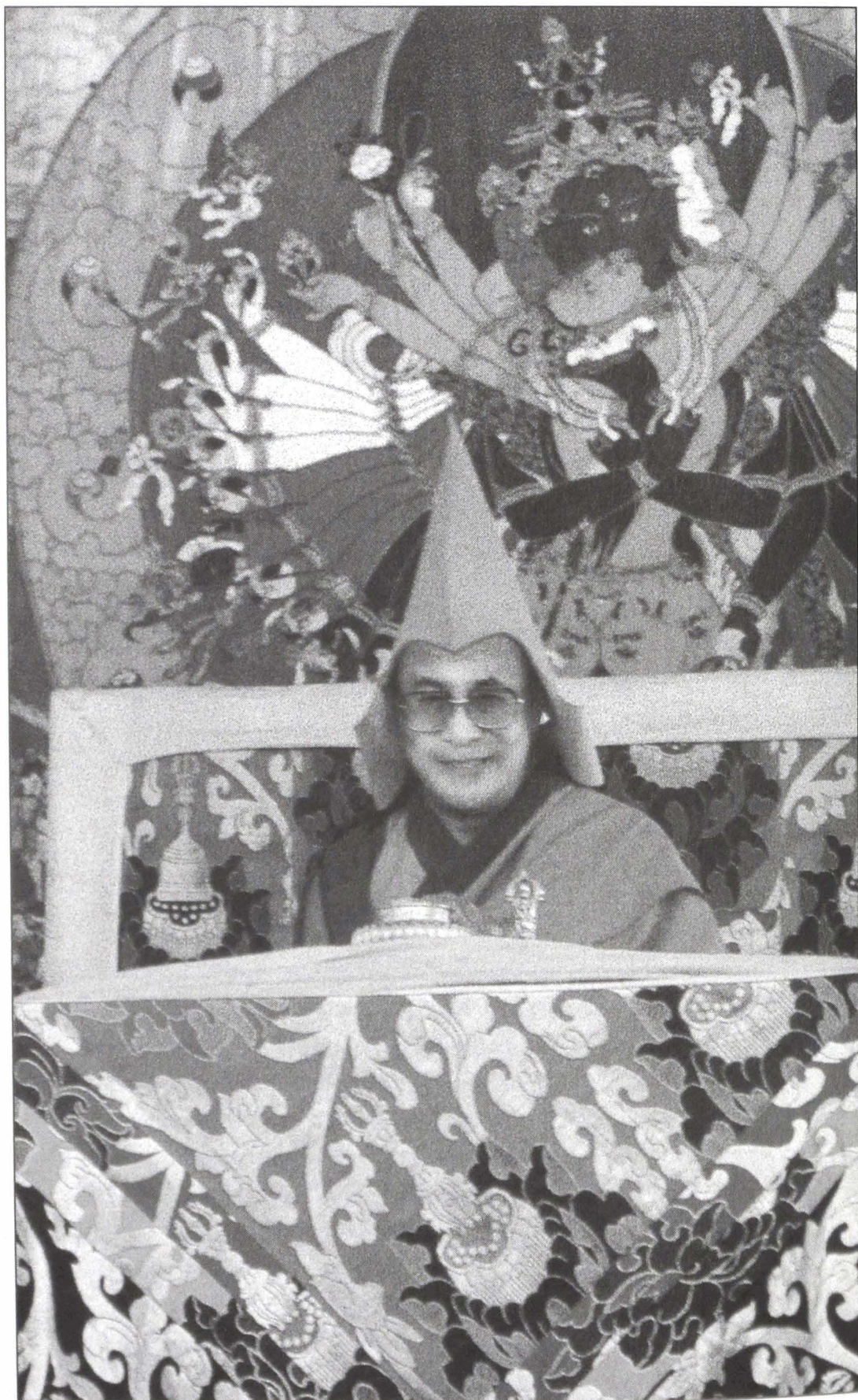
Tenzin Gyatso, the Fourteenth Dalai Lama.