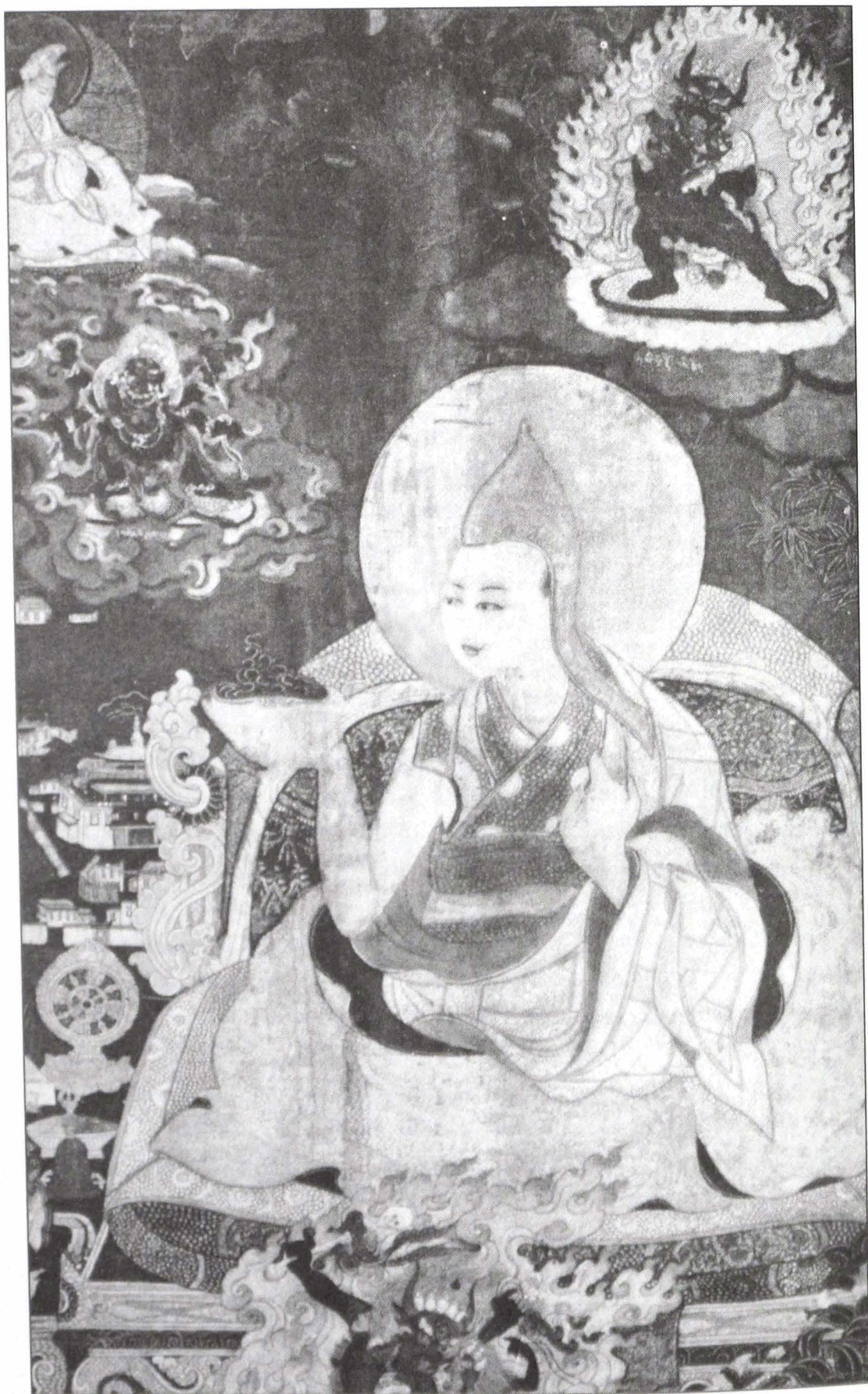
Yonten Gyatso, the Fourth Dalai Lama.