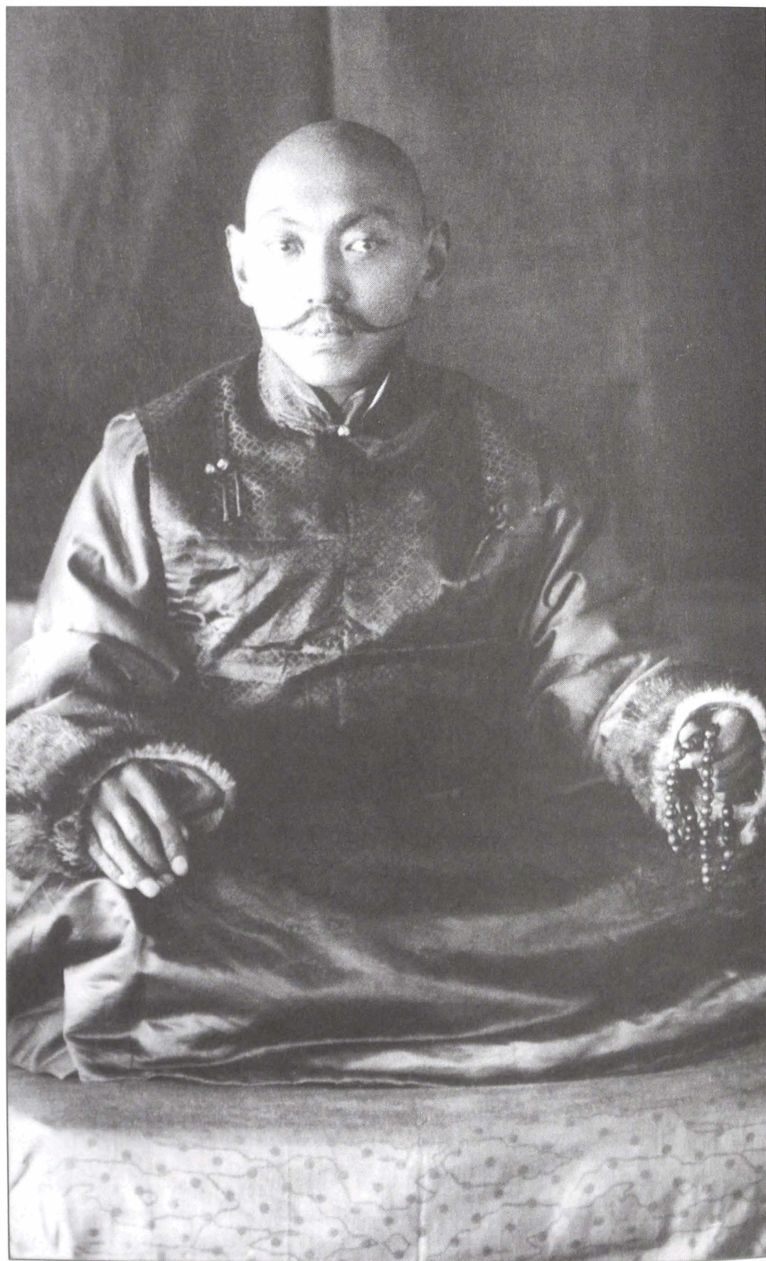
Tubten Gyatso, the Thirteenth Dalai Lama.