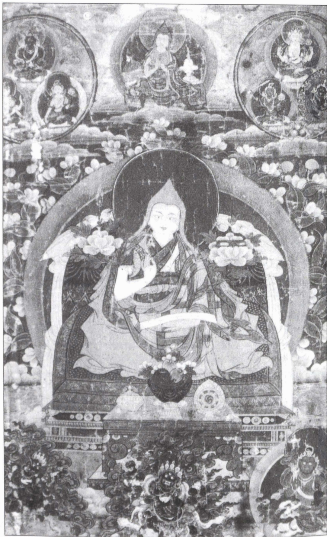
Tsultrim Gyatso, the Tenth Dalai Lama.