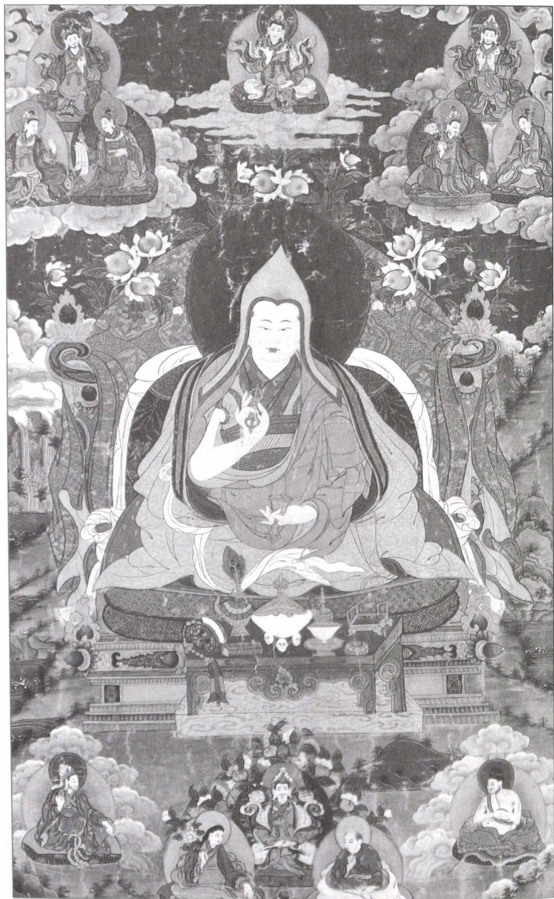
Sonam Gyatso, the Third Dalai Lama.