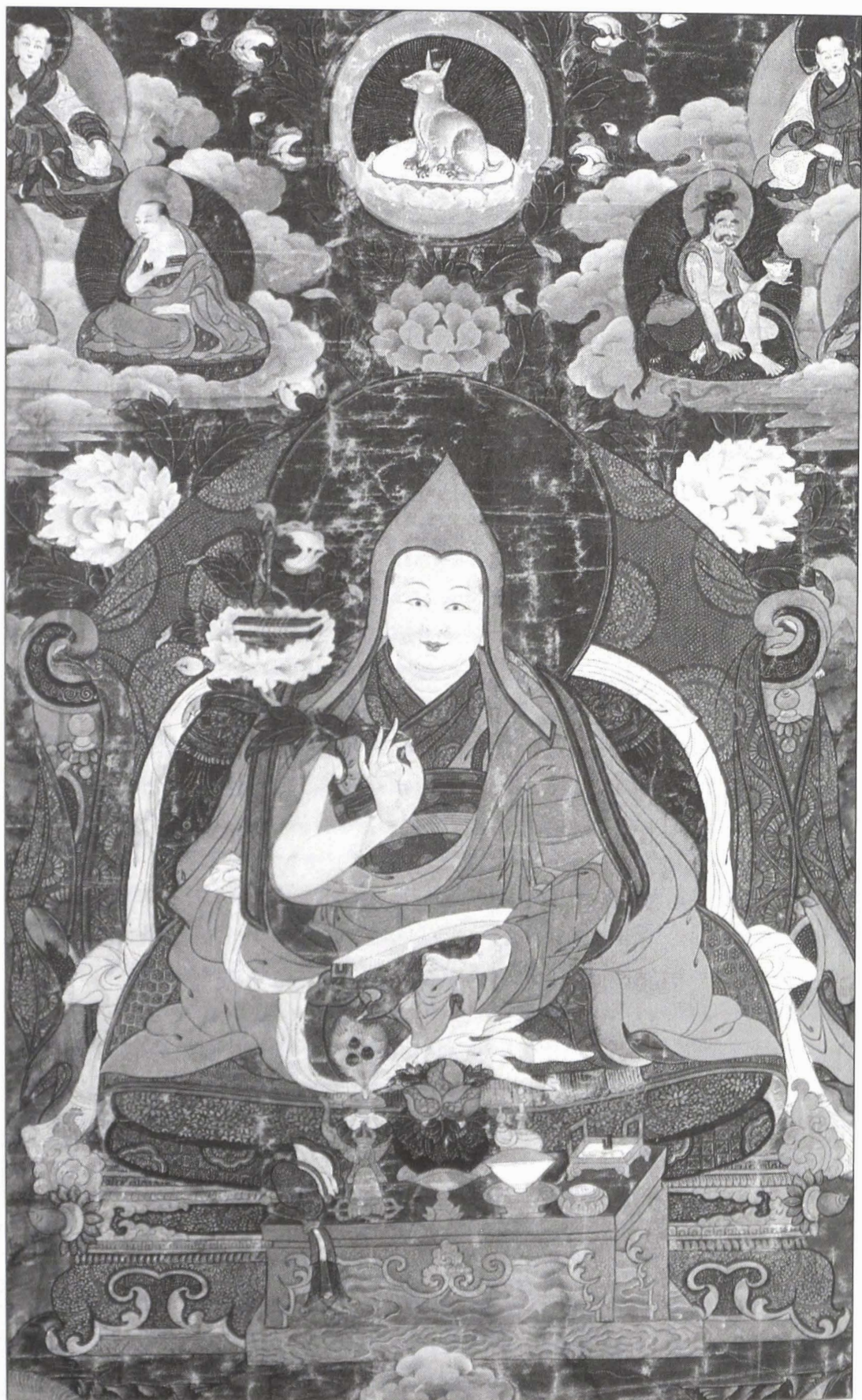
Kalzang Gyatso, the Seventh Dalai Lama. From Neg. No. 333399, Photo Log A, Courtesy of the Department of Library Services, American Museum of Natural History, New York.