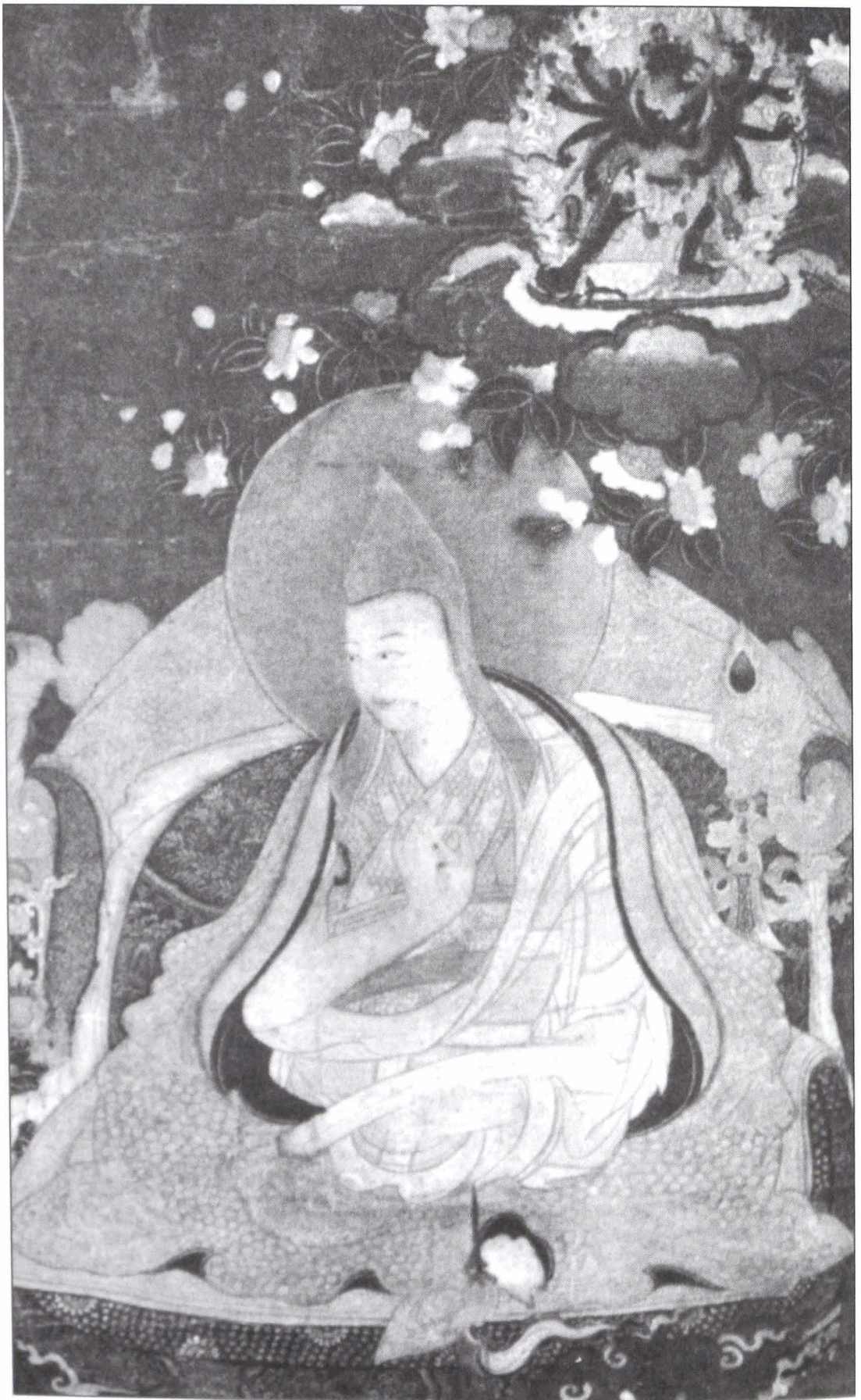
Gendun Gyatso, the Second Dalai Lama.