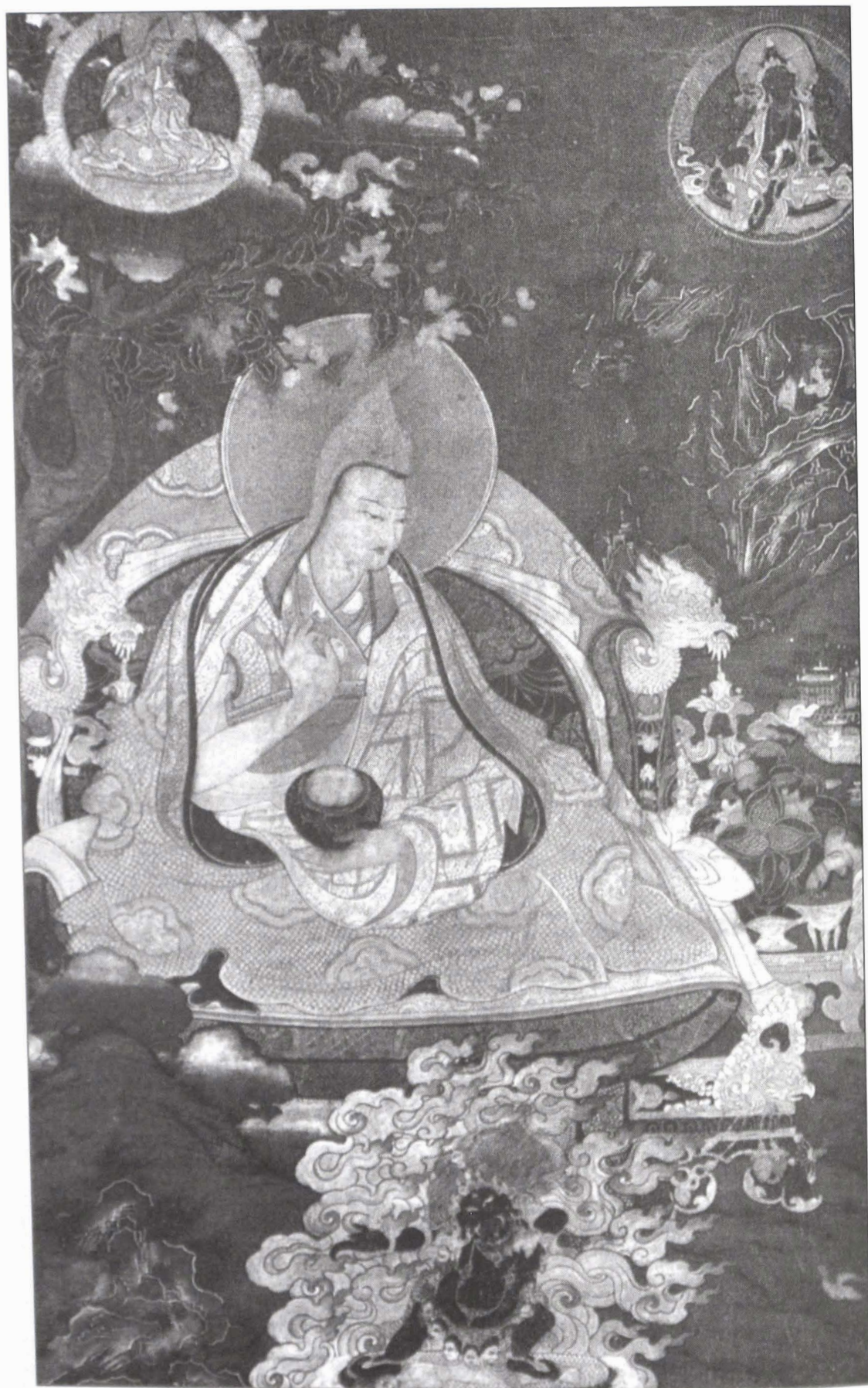
Gendun Drubpa, the First Dalai Lama.