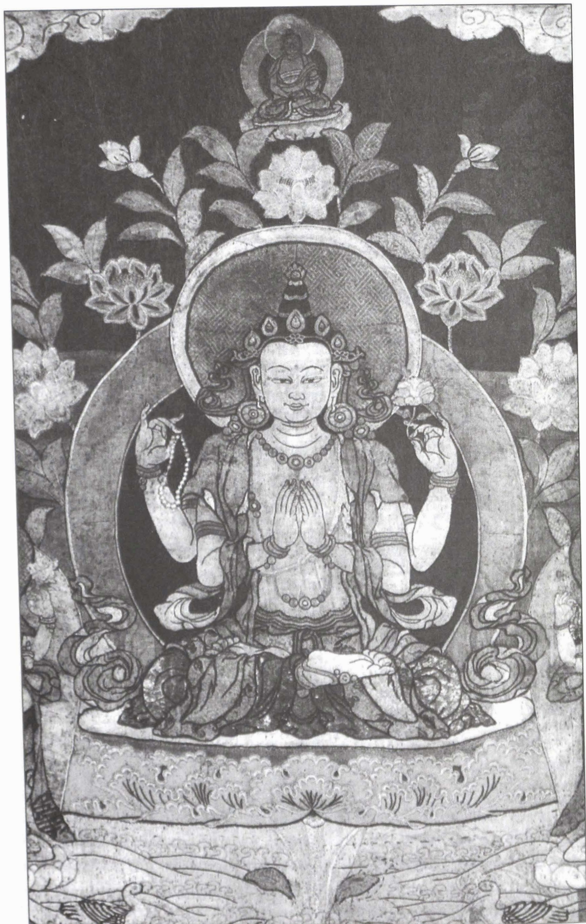
Avalokiteshvara, reproduction of an 18th Century tangka.