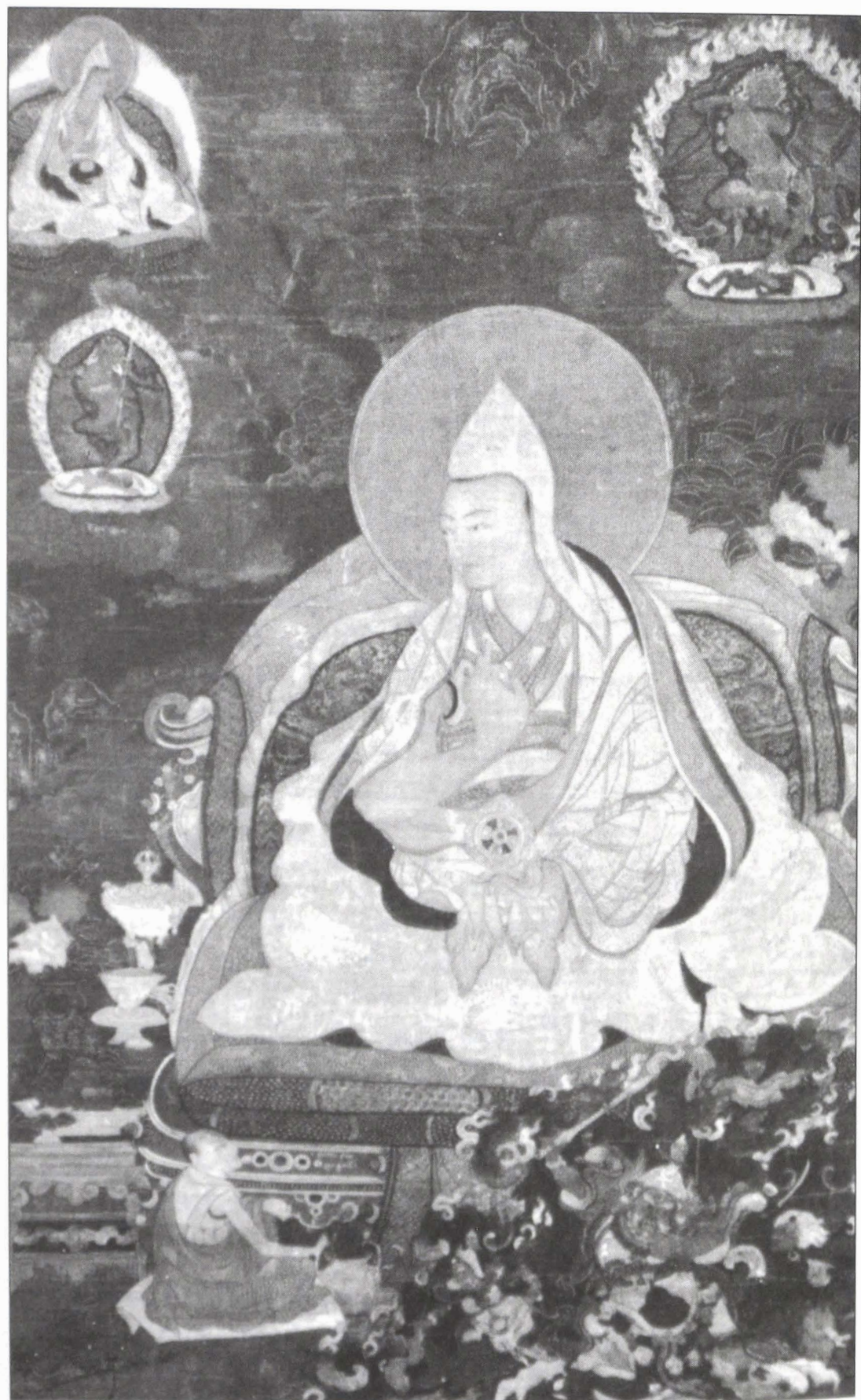
Tsangyang Gyatso, the Sixth Dalai Lama.