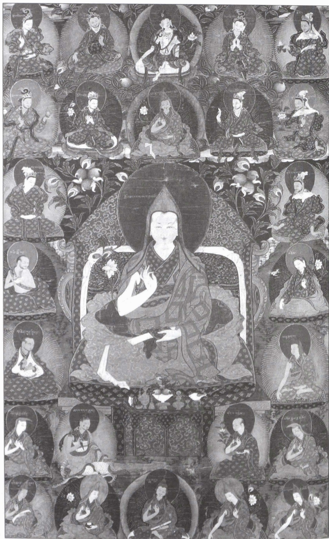
Jampel Gyatso, the Eighth Dalai Lama. Photo from Neg. No. 336309, photo by Peter Goldberg. Courtesy of the Department of Library Services, American Museum of Natural History, New York.